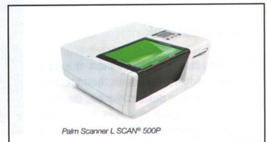
Palm Scanner L SCAN® 500P

Cross Match Technologies is headquartered in the USA and has an additional location for development, production and sales in Germany.